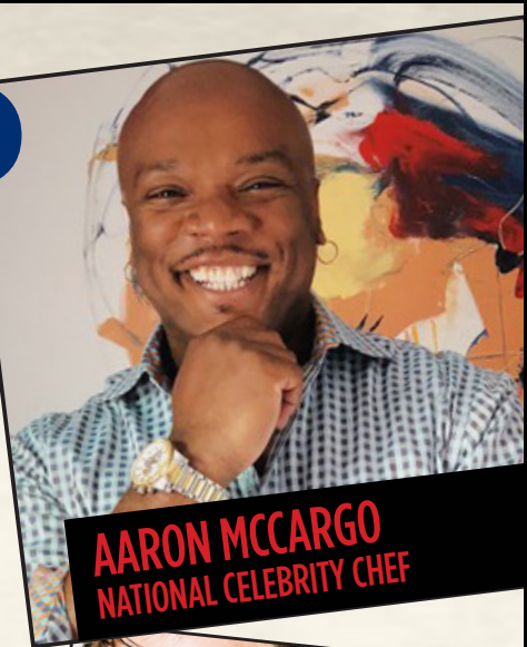
AARON MCCARGO NATIONAL CELEBRITY CHEF

$119 Executive Chef — Show, Recipe, Cool Merchandise, Ingredient Box, Wine & Spirits, Exclusive Yono's/dp promo, and Delivery by Falcon Club